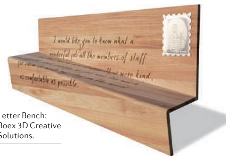
Letter Bench: Boex 3D Creative Solutions.